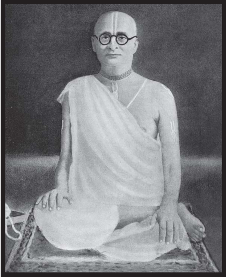
Nityalīlā-pravista Om Viṣṇupāda 108 Śrī Śrīmad Bhaktisiddhānta Sarasvatī Ṭhākura